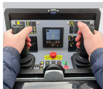
LMC (Load Moment Control) Variable outreach and up to 2 actions at a time (1 per joystick)