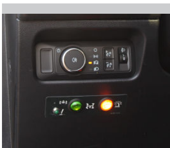
Integrated control panel for Versalift in cabin

Outtrigger pads with holders Flashing lights on the roof Aluminium cabinets for the chassis Safety stripes (red/white) Tilt sensor Inverter Full Home function