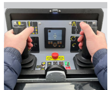
LMC (Load Moment Control) Variable outreach and up to 2 actions at a time (1 per joystick)