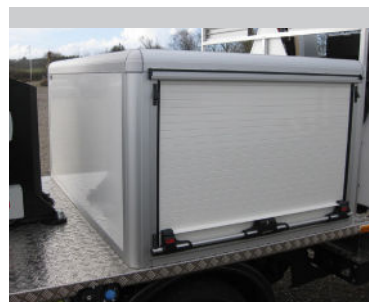
Big fiberglass toolbox across flatbed (option)