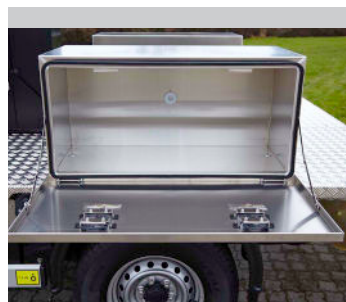
Aluminium cabinets for the chassis (option)